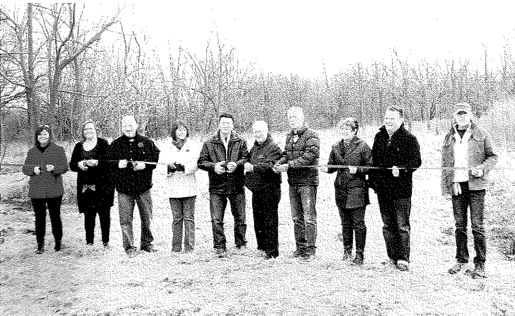
Representatives from the Heritage Green Community Trust, City of Hamilton and Hamilton Conservation Authority unveil the lands expected to form a new Conservation Area.